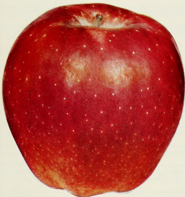
(Two-thirds actual Size)